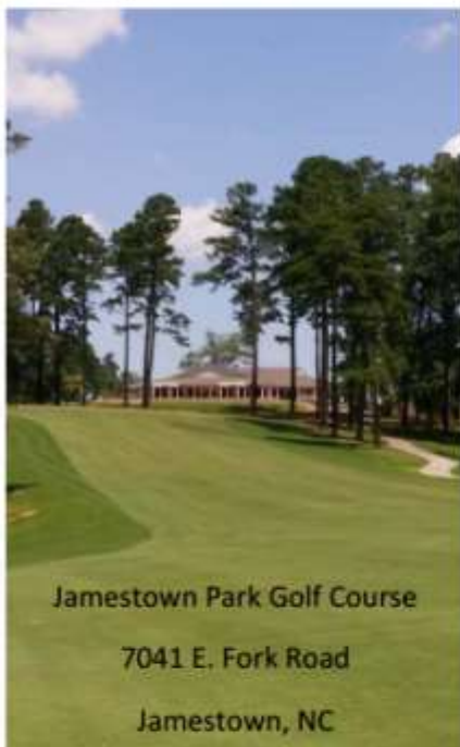
Jamestown Park Golf Course